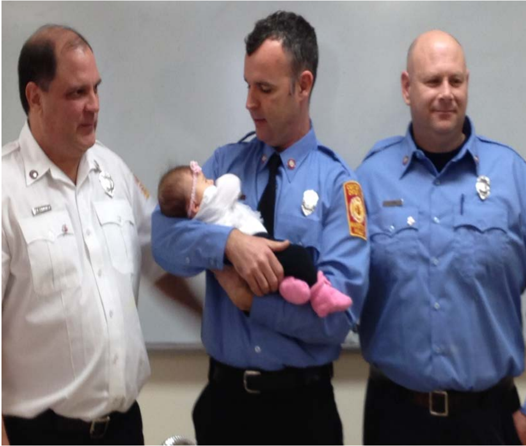
“Stork Pin Ceremony”